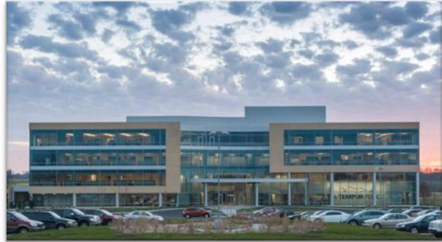
Tempur-Sealy International's 128,000 square foot headquarters located at UK's Coldstream Research Campus.

Tempur-Sealy located its world headquarters in Lexington to take advantage of the city's administrative and managerial services sector and business environment. Tempur-Sealy is the worldwide leader in premium and specialty mattresses and bedding products. The company is focused on developing, manufacturing, and marketing advanced sleep surfaces that help improve the quality of life for people around the world. Their products are currently sold in over 80 countries.