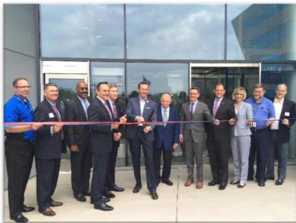
Grand Opening for Valvoline USA's new 162,400 square foot global headquarters in Lexington (2017).

Valvoline, the chemicals company, has been based in Lexington for over 30 years. In 2017, the company opened a new $35 million global headquarters and R&D operation. Locating Valvoline's headquarters in Lexington demonstrates the confidence that the company has in our community and workforce. The company continues to be an important member of Lexington's Business and Professional Services sector.