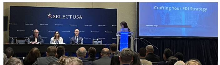
Pictured above: FDI Panel Discussion at Select USA