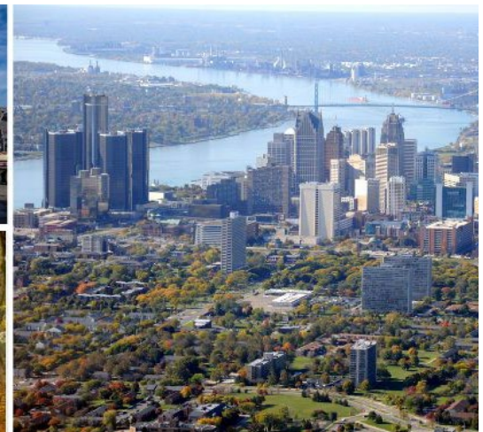
Pictured above: Detroit, Michigan, which has experienced remarkable success in economic development in recent years.