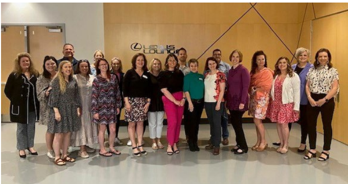
Pictured Above: Construction Diversity Accelerator Graduating Class of 2023

Commerce Lexington is proud to be a community partner in the Construction Diversity Accelerator Program. This long-standing initiative of Turner Construction recently concluded its second year in partnership with UK Supplier Diversity and KY APEX Accelerator (formerly KYPTAC). Throughout the program, participants engaged in weekly sessions covering key construction topics, made new business connections, created a capability statement, learned about resources and bidding opportunities, and competed in a mock bid. The ten-week program concluded Tuesday, May 9th with the graduation of 31 participants.