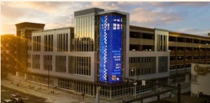
The Cornerstone at University of Kentucky.

In January, the Economic Development team received an invitation to tour the University of Kentucky's recently announced innovative campus-community partnership located at The Cornerstone, UK's newest 26,000 square foot facility designed to foster community, creativity, technology, entrepreneurship and equitable economic development. We are optimistic to continue conversations and collectively foster business recruitment projects and retention among students in one of Lexington's key target industries – the high-tech industry.