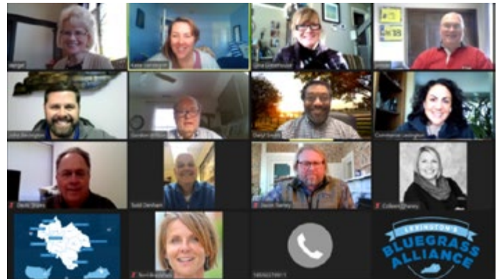
The Bluegrass Alliance met virtually in February to begin plans for new outreach initiatives.

Our regional group has been together for over 25 years and has been very successful in building trust and partnerships. Commerce Lexington Inc. receives many Request for Proposals from consultants and works to organize responses in a regional nature to leverage the strength of the Bluegrass area.