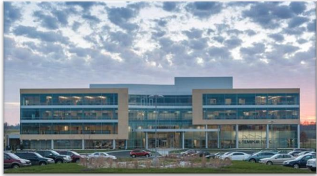
Tempur-Sealy International's 128,000 square foot headquarters located at UK's Coldstream Research Campus.

Tempur Sealy located its world headquarters in Lexington to take advantage of the city's administrative and managerial services sector and business environment. Tempur Sealy is the worldwide leader in premium and specialty mattresses and bedding products. The company is focused on developing, manufacturing, and marketing advanced sleep surfaces that help improve the quality of life for people around the world. Their products are currently sold in over 80 countries.