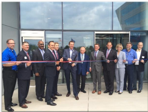
Grand Opening for Valvoline USA's new 162,400 square foot global headquarters in Lexington (2017).

Valvoline, the chemicals company, has been based in Lexington for over 30 years. In 2017, the company opened a new $35 million global headquarters and R&D operation. Locating Valvoline's headquarters in Lexington demonstrates the confidence that the company has in our community and workforce. The company continues to be an important member of Lexington's Business and Professional Services sector.