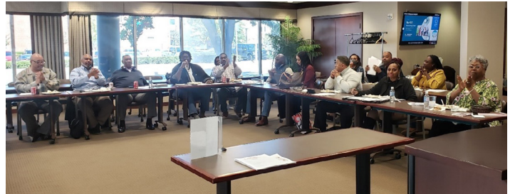
Photo from the Minority Business Expo Committee wrap-up session hosted by Commerce Lexington.