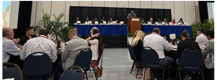
Scene from Minority Business Expo before Keynote speaker.