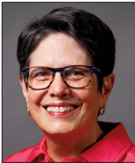
City of Lexington Linda Gorton Mayor