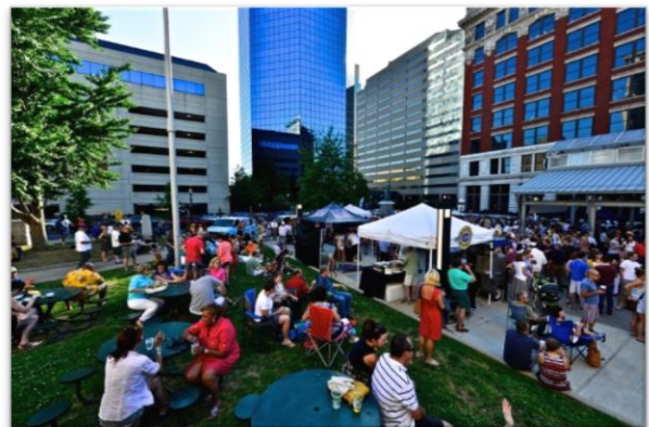
Thursday Night Live.

In the heart of downtown, the Fifth Third Pavilion at Cheapside Park operates weekly events and supports a vibrant nightlife. Thursday Night Live, an outdoor live music event, is held weekly from April to October at the Pavilion and attracts an average of 2,300 people each week. Every Saturday, over 3,000 people visit the Farmers’ Market at the Pavilion to purchase local produce, meats, cheeses, and other products while enjoying downtown.