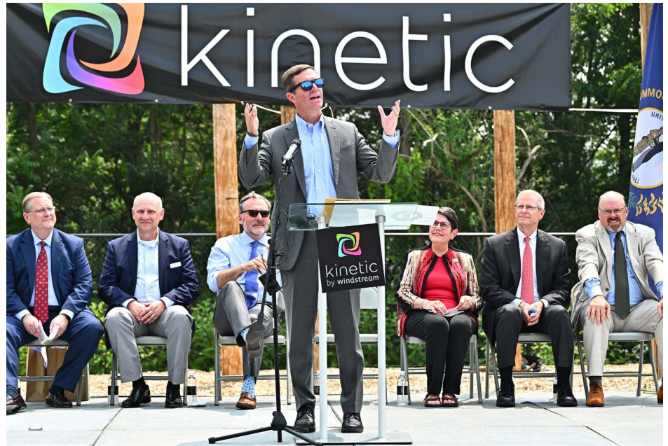
Local and state officials gathered on June 28th to mark the grand opening of Kinetic by Windstream's regional headquarters in Coldstream Research Campus.