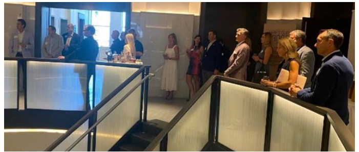
Late summer global CEO networking event hosted at VisitLEX inside the historic Courthouse Square.